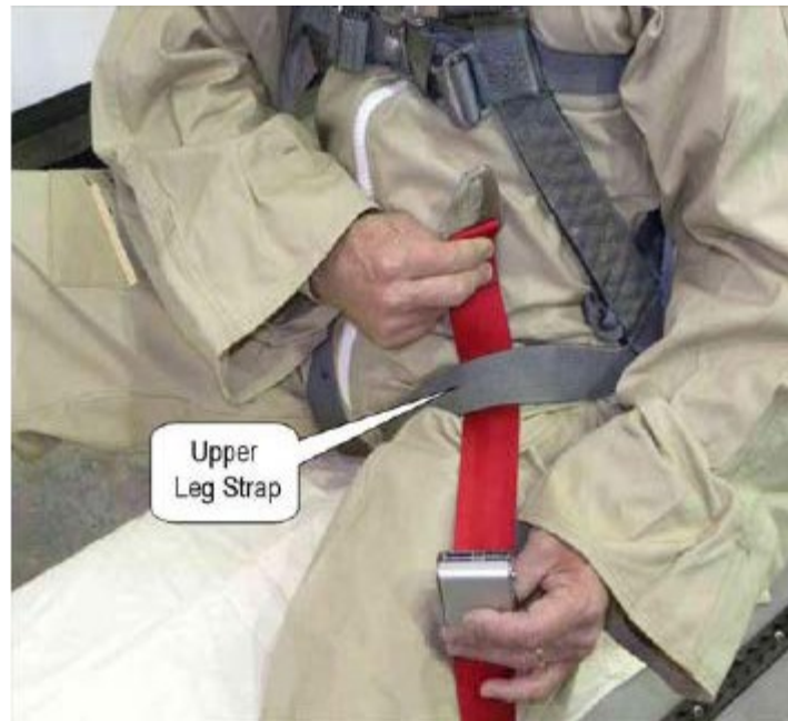
FIGURE 5. PASS TETHER LOOP UNDER MAIN LIFT WEB