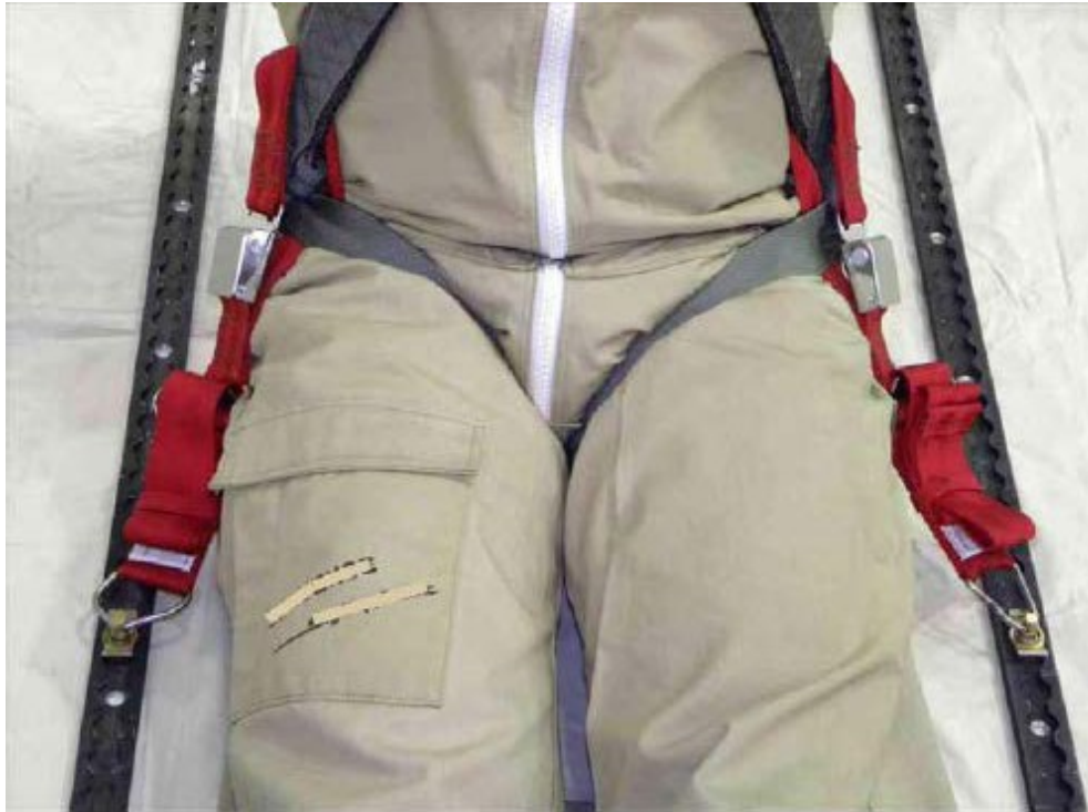
FIGURE 9. DUAL POINT, DUAL TETHER RESTRAINT ATTACHMENT TO FLOOR FOR REAR-FACING STRADDLE