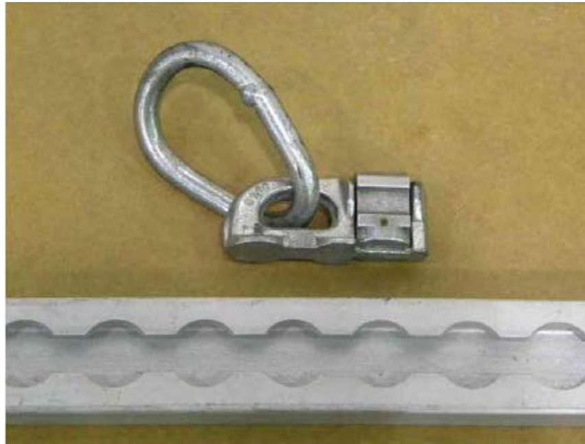
FIGURE 3. TETHER RESTRAINT USAGE